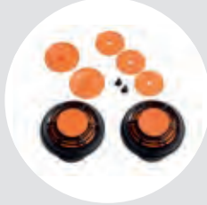
SR 200 Membrane Kit ART NO R01-1204