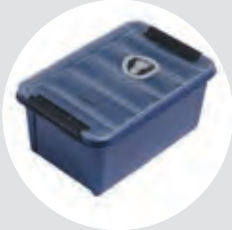
SR 344 Storage box for FF mask ART NO T01-1214