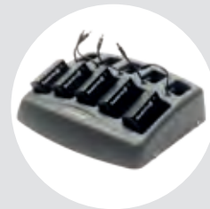
SR 516 charger & chargerstand ART NO T06-0111