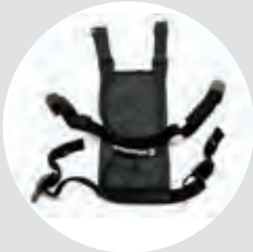
Head Harness for SR 200 ART NO R01-1203