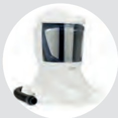
SR 586 Hood for SR 520, SR 530, SR 543, SR 580 ART NO T06-0806