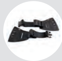
SR 504 Rubber Belt ART NO T06-0104