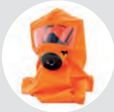
SR 345 Protective Hood ART NO H09-1012