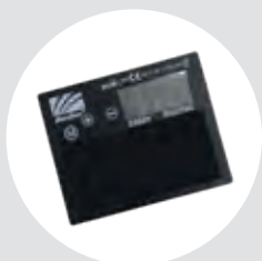
Auto Welding Lens 4/5-13 ART NO R06-4508 Auto Welding Lens 4/9-13 ART NO T06-4009