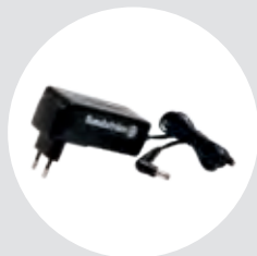
Battery charger SR 700 ART NO R06-0706