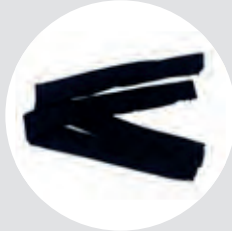
Hose Protection for SR 952 Twin Hose ART NO T01-3004