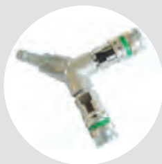
Y coupling ART NO R03-2127

The SR 292 main filter consists of a carbon filter part (500g), surrounded by two P3 particulate filters. The air is cleaned to remove any remaining particles/gases/vapours/odours.