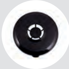
Prefilter holder ART NO R01-0605