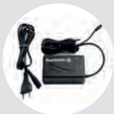
Battery charger SR 500 ART NO R06-0103