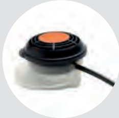
SR 328 Fit Test Adaptor ART NO T01-1202