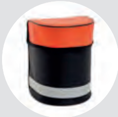
SR 339 Storage pouch for half mask ART NO H09-0112