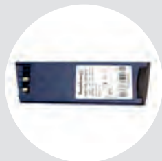
SR 502 Battery HD 3.6Ah ART NO T06-0101 (SR500)