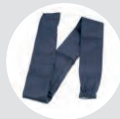
SR 59021 Hose Cover ART NO T06-4016