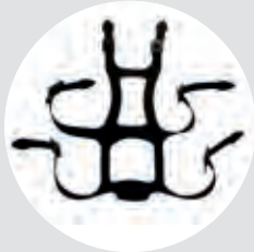
Head Harness NR for SR 200 ART NO T01-1215