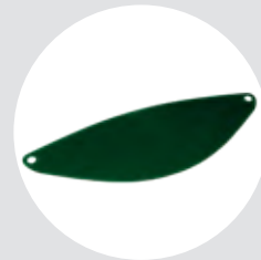
Visor 2/3 EN 5 for SR 570 ART NO T06-0605