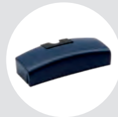
Battery SR 700 ART NO R06-0705