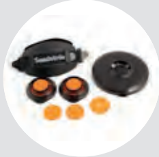
Service Kit SR 100 / SR 90-3 ART NO R01-2005 Service it for SR 900 ART NO R01-3005