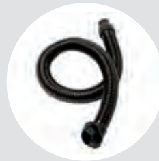
SR 550 / SR 551 Breathing Hose ART NO T01-1216 / T01-1221