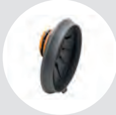
Filter holder for SR 900 ART NO R01-3003