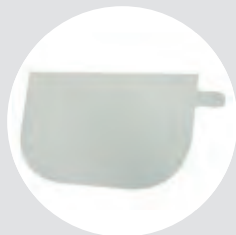
Protective Film SR 522 T06-0201 SR 570 T06-0601 SR 542 T06-0501 SR 580 T06-0801