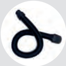
SR 951 Single Hose ART NO T01-3003