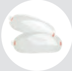
Protective Film SR 343 / SR 353 ART NO T01-1204 / T01-1205