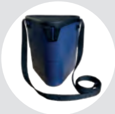
SR 230 Storage Box for half mask ART NO H09-3012