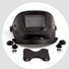
SR 584 Welding Shield ART NO T06-8010