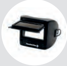
SR 84 Welding cassette ART NO T01-1212