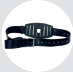
Leather Belt for SR 905 ART NO R01-3006