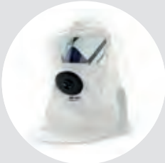
SR 64 Hood for half mask ART NO H09-0301