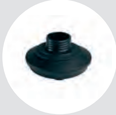
SR 280-3 Filter adapter ART NO H09-0212