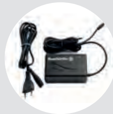
Battery charger EX ART NO R06-2003