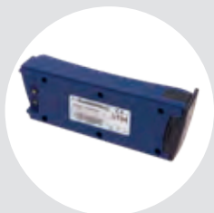
Battery Standard 2.2 Ah ART NO R06-0108 (SR500)