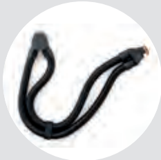
SR 952 Twin Hose ART NO R01-3009