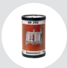
SR 292 Filter cartridge ART NO R03-2001