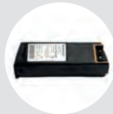
SR 501 EX Battery ART NO R06-2002