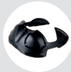
Bump Cap for SR 570 ART NO T06-0602