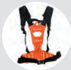
SR 552 EX Harness ART NO T06-2002